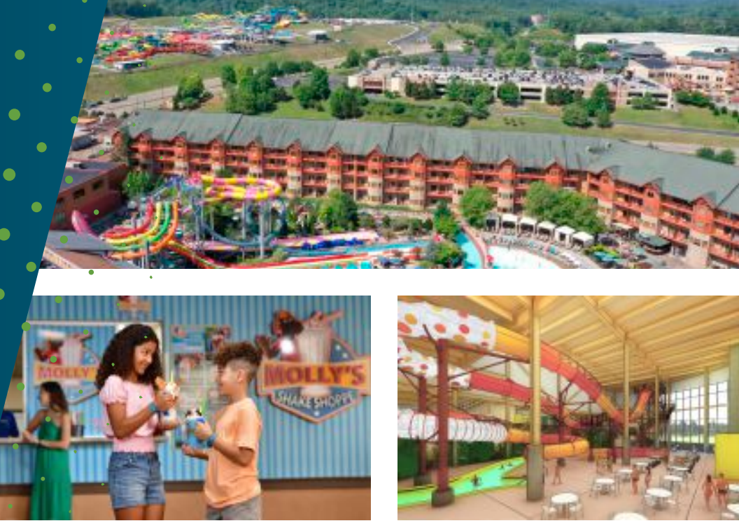
From dine-in restaurants to grab-and-go eateries to sweet-and-treat shops, the Wilderness has all the dining options covered.

"THE INDOOR WATERPARK CONCEPT TRULY WAS A GAME CHANGER, NOT ONLY FOR OUR RESORT, BUT FOR WISCONSIN DELLS."